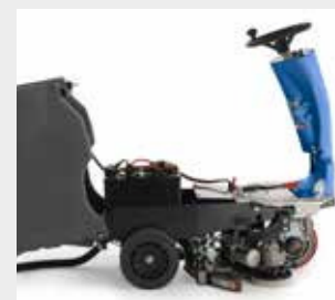
Immediate opening/access to all the main components