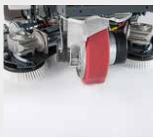
Outstanding 4 brushes-deck system