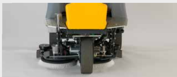
Twin brushes-deck system