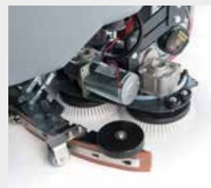
Compact and responsive squeegee