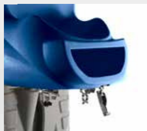
Wide rec. tank opening: easy to clean

Rider R 65 is the new compact ride on scrubber dryer in Ghibli & Wirbel's range. 65 liters of tank capacity together with high productivity (3250 m 2 /h) and running time, guarantees the perfect solution in any kind of environment. Every details has been studied to guarantee the perfect ergonomics and ease of use. The main distinctive feature is the incredible manoeuvrability; cleaning closed to wall in small areas and making the impossible U-Turn operation (only 115 cm), makes Rider the perfect choice for those who work in the most narrow and congested areas. The machine is suitable also for day cleaning in sensitive areas like hospitals and schools, thanks to the low noise level. The FD 65 version, with front traction, is equipped with the innovative brush head system: four small brushes with an excellent down pressure, surrounding the driving wheel, for the best floor coverage and cleaning results, even in small spaces or congested areas. Rider compact squeegee (750 mm) naturally adapt itself to every movements of the machine. The results are excellent drying performance on every kind of surface even in sharp curves and during the impossible U - turn operation. The BC version is equipped with external battery charger and battery set (105 Ah): it allows more than two hours and a half of working session without any stop!