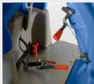
Lever lifting/regulation system (squeegee, brush deck, water flow)

Rider R 65 is the new compact ride on scrubber dryer in Ghibli & Wirbel's range. 65 liters of tank capacity together with high productivity (3000 m 2 /h) and running time, guarantees the perfect solution in any kind of environment. Every details has been studied to guarantee the perfect ergonomics and ease of use. Compact dimensions, the incredible manoeuvrability, the low noise level and high productivity makes Rider suitable for any environment and surface. The RD 55 version, with rear traction and a classic twin brushes system, combined with the compact and well performing squeegee (only 650 mm), guarantees the best cleaning and drying performance. The BC version is equipped with external battery charger and battery set (105 Ah): it allows more than two hours and a half of working session without any stop!