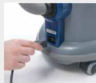
Socket for power brush