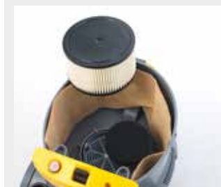
Motor protection filter + cartridge filter