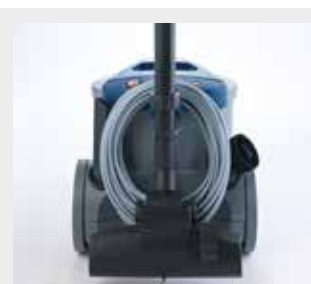
New fixing system