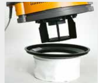
Filter cage and standard filter