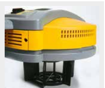
Inlet and outlet of motor cooling air