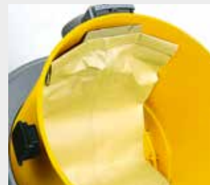
Paper filter bag