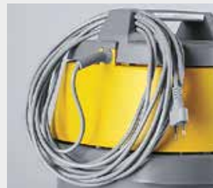
Hook for power supply cable

Classic and strong, product super time proved. Possible connection with an electric power brush. HEPA Cartridge filter (optional). Energy efficiency class: B.