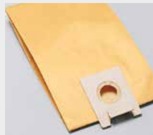
Ecological paper filter