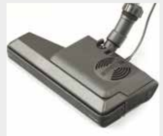
Electric power brush (optional)