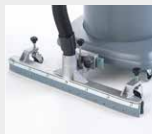
Gangway tool (optional)