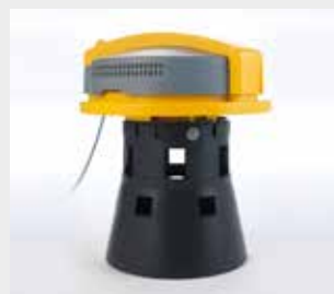
Floating system and filter cage