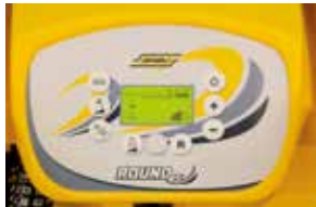
Control panel with display.

Round 45 is the last news in the Ghibli's scrubber dryers range. The innovative and functional design makes the machine ergonomic and easy to use in the daily activities. The technical features and the high level innovations – 45 liters tank capacity, three hours running time, the control panel with display, the double brush pressure, the silent mode function and the new chemical mixing system – make Round 45 something unique in its market segment, ideal for effective cleaning results in every kind of floor/environment.