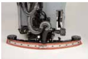
Adjustable and compact squeegee

PRODUCTIVITY: 45 liters tank capacity, the wide cleaning path ( 530 and 610 mm , depending on the variant), the great running time(3 hours), the remarkable speed (up to 5 km/h ). High quality features which combined together ensure the maximum productivity. For an easy daily job in any kind of surface/area.