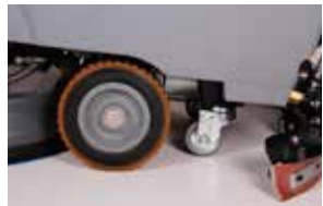
Pivoting wheels under the chassis and their short distance

PRODUCTIVITY: 45 liters tank capacity, the wide cleaning path ( 530 and 610 mm , depending on the variant), the great running time(3 hours), the remarkable speed (up to 5 km/h ). High quality features which combined together ensure the maximum productivity. For an easy daily job in any kind of surface/area.