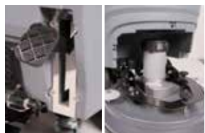
Double brush pressure (by pedal).

SILENT: as soon as you push the silent mode button on the control panel, Round 45 becomes immediately more “quiet”, without losing its performance. Ideal for day cleaning and in all the environments (hospitals, schools, ...) where silence is strictly required.