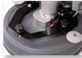
Double knob for brush regulation