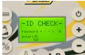
Access password (it can be enabled on demand)

MANOEUVRABILITY: the new ergonomic, “rotating” handle activates all Round 45 working functions, guaranteeing the max reliability and comfort. The pivoting wheels under the chassis ensure the best manoeuvrability and control.