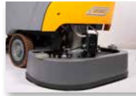
Twin brushes with splash guard

Battery operated, twin brushes (24"), with traction