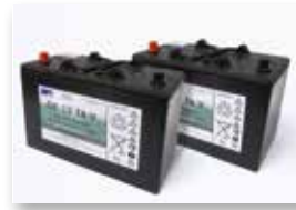
76 Ah batteries