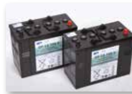
105 Ah batteries