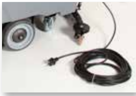
25 mt detachable cable