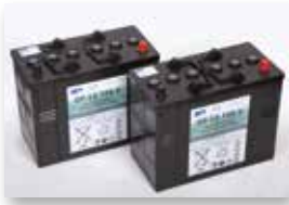
105 Ah batteries

Battery operated, single brush (21"), with traction