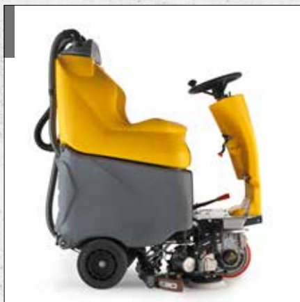
RIDER R 65 FD 65

Three separate levers allow the user to lift up and down both the squeegee and the brush head and to manage in an easy way the water flow.