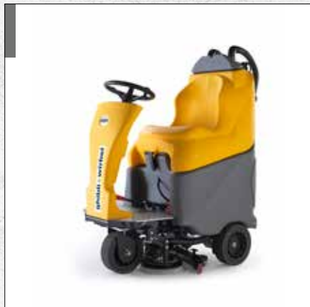
RIDER R 65 RD 55