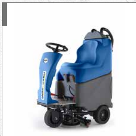
RIDER R 65 RD 55 BC