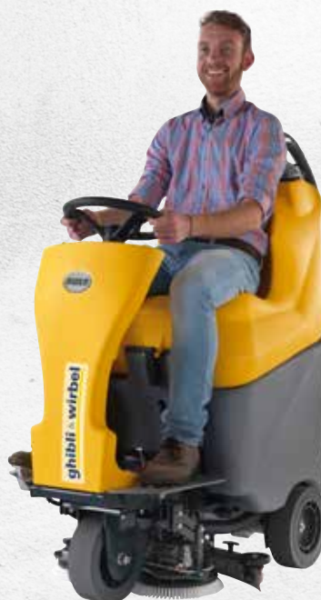
RIDER R 65 FD 65

Available in both institutional colors. Battery charger 24V 20A, battery set (2 pcs) 12V 105 Ah on standard equipment