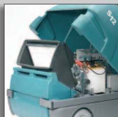
Easy filter change