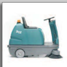
Standard side brush