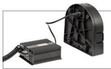
Chargers and battery