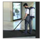
Light and comfortable